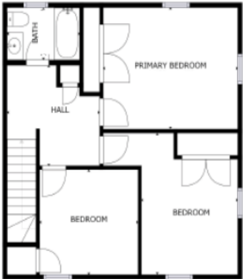
76 George Road