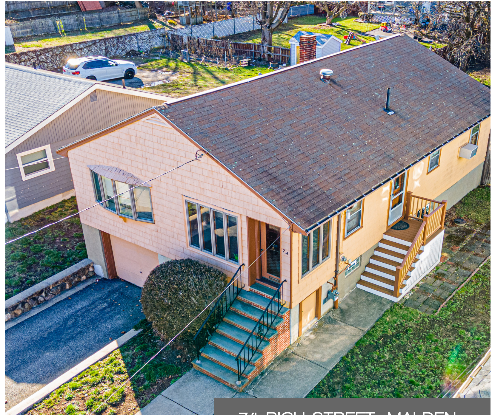
74 RICH STREET, MALDEN